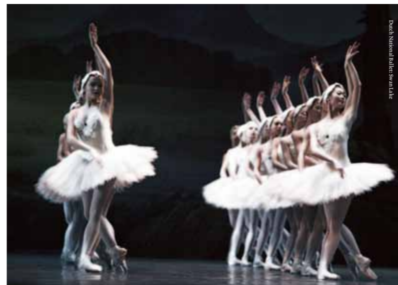
Dutch National Ballet: Swan Lake