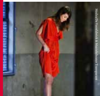
Melkior/Verschuik & Muziektheater Transparant